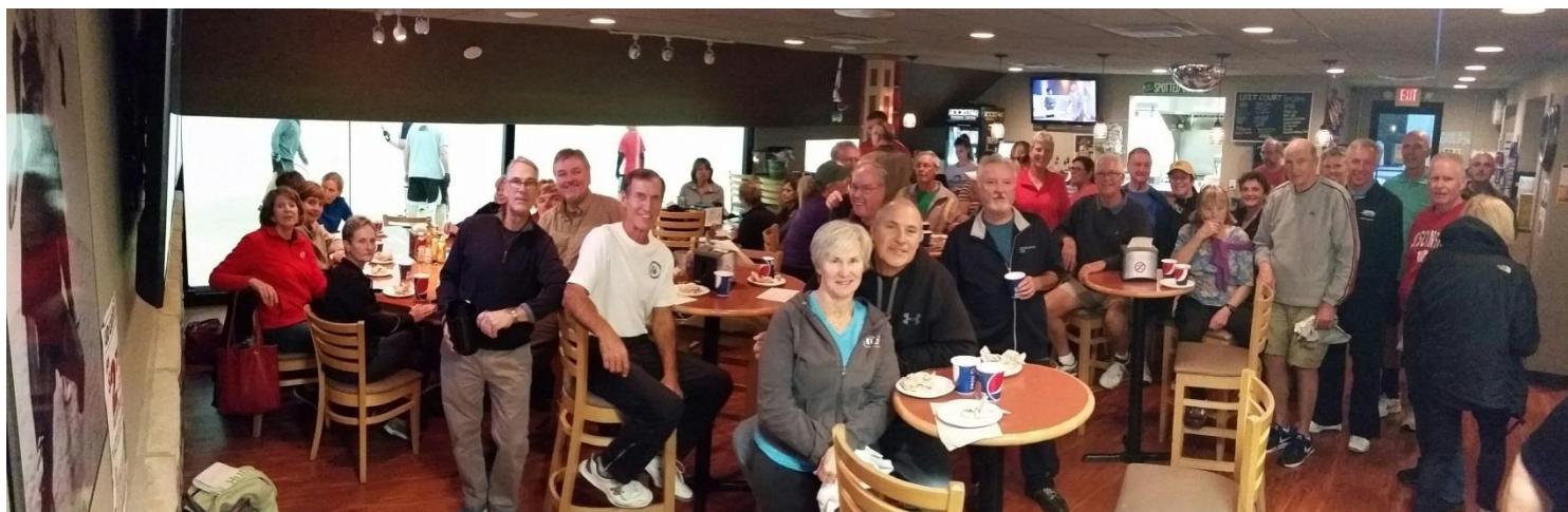
Participants at the PAC Lost Court (bar) for pizza and more socializing