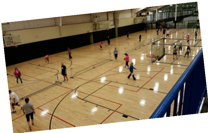
The beginner lesson in action