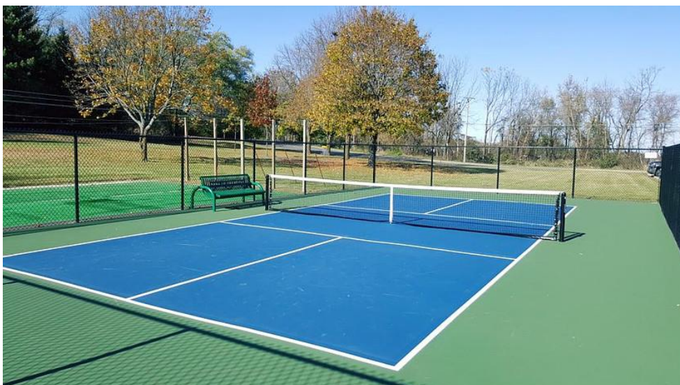
The new court in the Village of Deerfield

If you know of a court that is not listed, please email details to pickleball@capareapb.com .