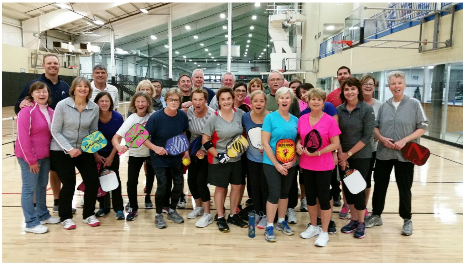
The beginner group and the instructors