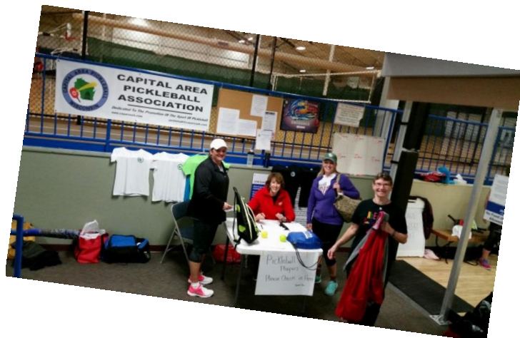
The CAPA event registration table